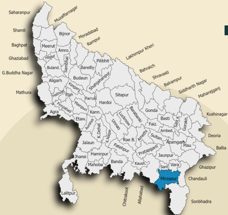
Banana cultivation in the district of Mirzapur, Uttar Pradesh