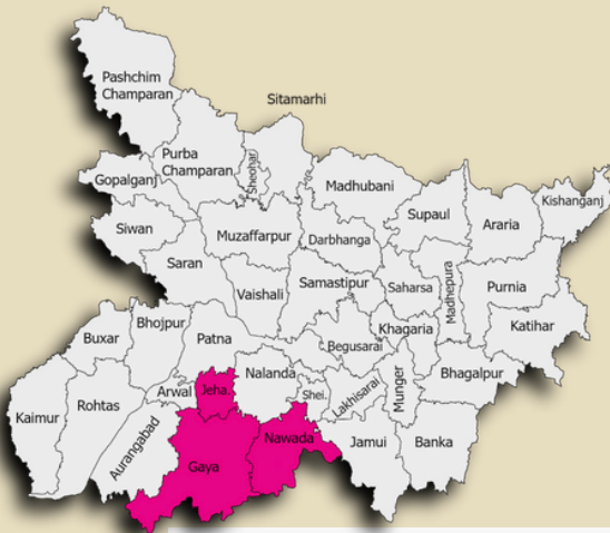
Loan Disbursed to the Federations in Bihar (2023-24)